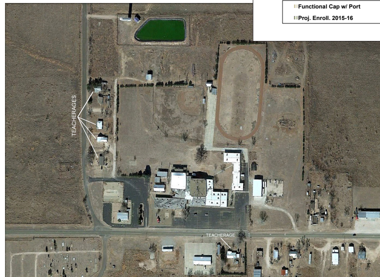
Comparison of Project Enrollment vs. School Capacity (above)