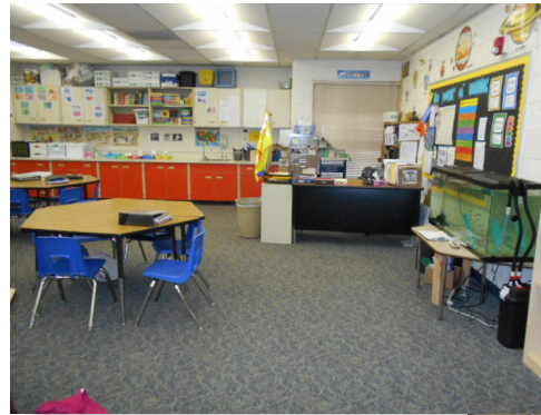
Apache ES Classroom