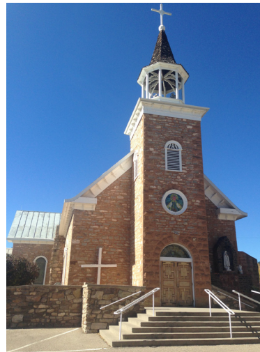
Above: San Antonio de Padua Church