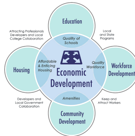
Above: Economic development components