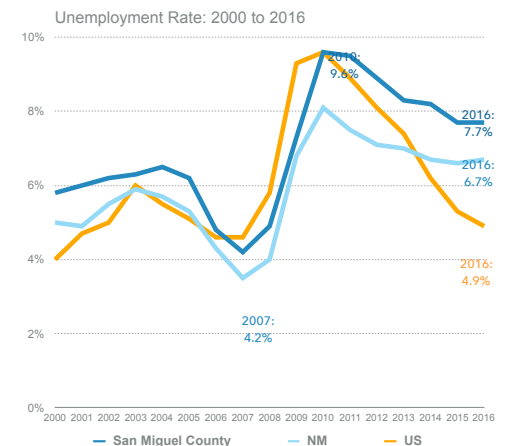
Below: Unemployment rates