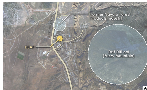
Dził Dít'ooí School of Empowerment, Action and Perseverance