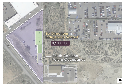
Six Directions Indigenous School