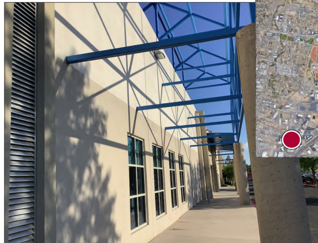
Below: BCBS service center