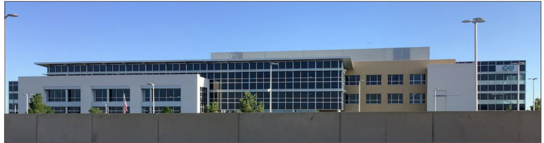
Above: BCBS headquarters